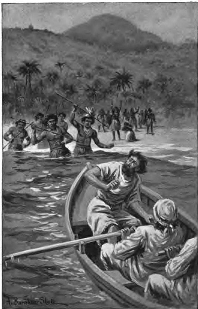
“Mow-Mow and some six or seven other warriors rushed into the sea.”